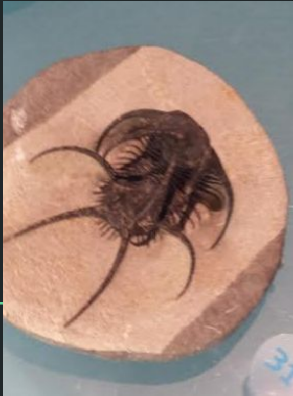
This is a picture of our favorite Trilobite.

Here is a picture of Jenna next to a huge arthropod.